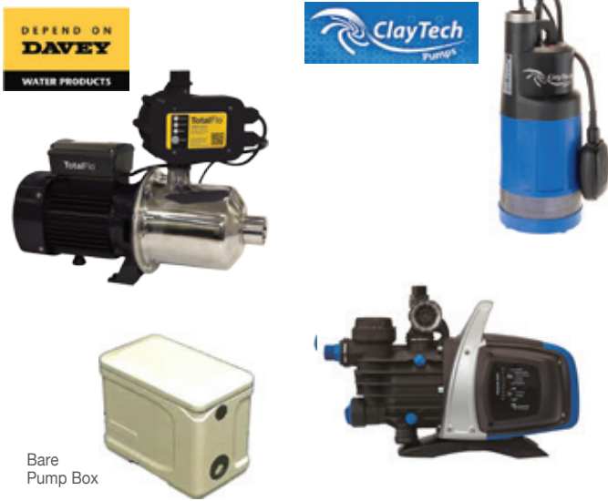
Bare Pump Box

Team Poly recommend Davey and ClayTech pumps.